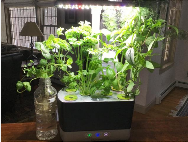
Aero Garden w/ mint on the side