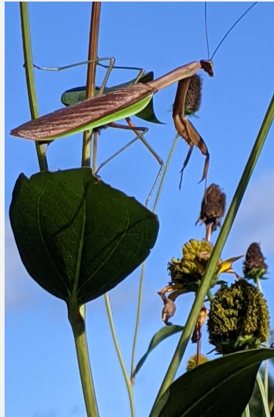
Surprise in Judy's garden! A praying mantis!