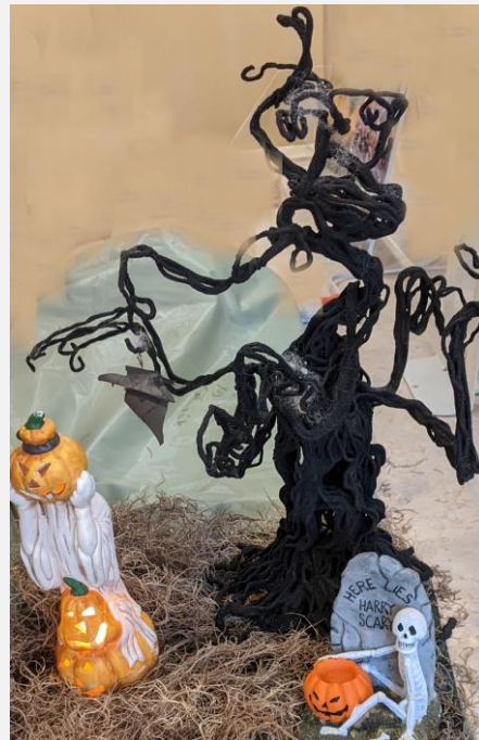
Another picture of TERRY COFFIN'S Halloween diorama