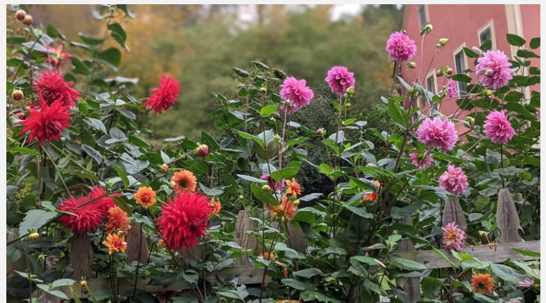
Dahlias in Marijke's garden