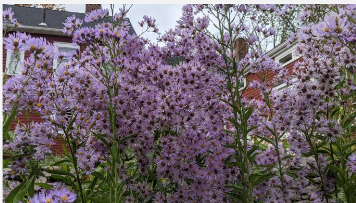
Can anyone identify this very tall, very late- blooming aster in Carlene's garden?